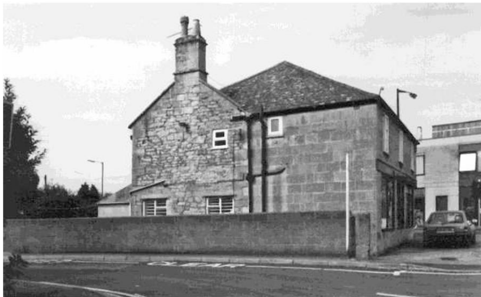
Site of Old Red Lion - looking west.

The present “Red Lion”, by the roundabout on Odd Down, at the present Frome Road/Wellsway junction, was moved from its old site after Macadam had laid out the new part of the turnpike route to Wells in the 1820s (cf. Thorpe’s Survey of a 5-mile radius of Bath, 1742, and the Lyncombe & Widcombe Tithe map, 1839). The corner site of the old “Red Lion” is now marked by the Odd Down Pharmacy, with its modern frontage built onto a much older structure (possibly part of the old “Red Lion” premises), standing on the south-eastern side of the junction of Frome Road with the “Old Wells Road” (now Upper Bloomfield Road). The whole length of the present Bloomfield Road and Holloway, although an ancient route, is not to be confused (as it, and the present Wells Road from Odd Down to the Bear Flat, often have been) with the Roman Fosseway from Wells, which almost certainly turned at Odd Down along the line of the Saxon boundary of Lyncombe (still partly represented by the present Old Fosse Road there) to reach the river in the vicinity of the present Victoria Bridge, nearly half a mile west of the old walled city of Bath.